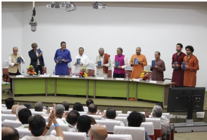
Figure 3 Book Release by dignitaries

In his inaugural address, internationally acclaimed Neuroscientist at the University of California, San Diego, Dr. Vilayanur S. Ramachandran discussed some of the cutting-edge findings of neuroscience. Shri Rajiv Malhotra pointed out to a huge applause that Tamil is the only ancient language that has remained in uninterrupted daily use by millions of people. Even Sanskrit cannot lay claim to such widespread use continuously for its entire history. He mentioned that Tamil culture is an important building block of the Indian grand narrative.