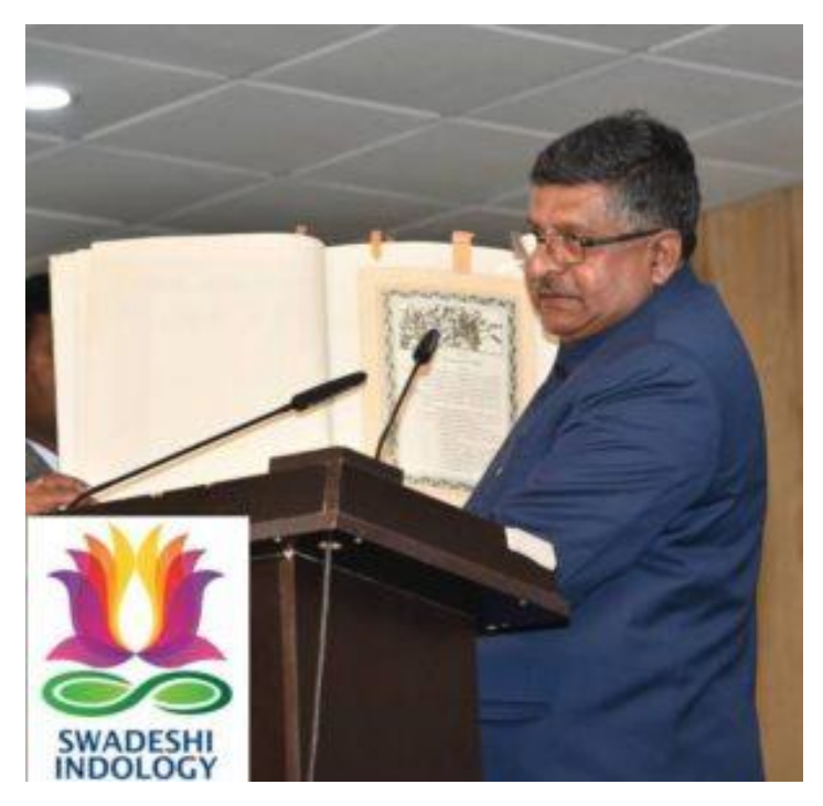
Sri Ravishankar Prasad, the Hon'ble Minister for Law and Information

bamboozling the reading public by an ostentation of scholarship: in width, depth, or impact, or even the novelty of ideas or interpretations – in short, in terms of the Neo-orientalism he has sought to bring about in a copiously camouflaged and convoluted language – he has added new negative dimensions to Indology (and hence totally incomparable to some of the earlier Orientalist Indologists, the damage caused by whom pales into the background in quality and quantity). So much for the raison d'être of the themes of the conference.