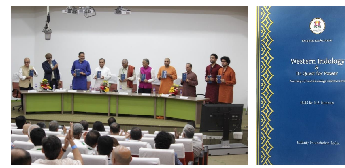
Book Release by dignitaries

In his inaugural address, internationally acclaimed Neuroscientist at the University of California, San Diego, Dr. Vilayanur S. Ramachandran discussed some of the cutting-edge findings of neuroscience. Shri Rajiv Malhotra pointed out that Tamil culture is an important building block of the Indian grand narrative. A book titled, Western Indology & Its Quest for Power , a consolidation of selected papers from the first two conferences of the SI series (SI – 1 and SI – 2) was released during the inauguration. Seven more volumes from SI-1 and SI-2 are in the pipeline.